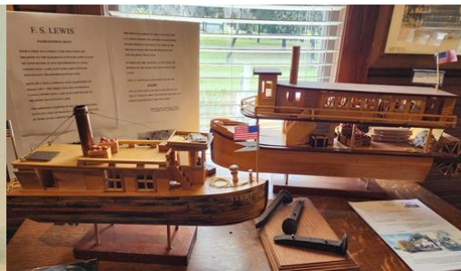
Alert and FS Lewis