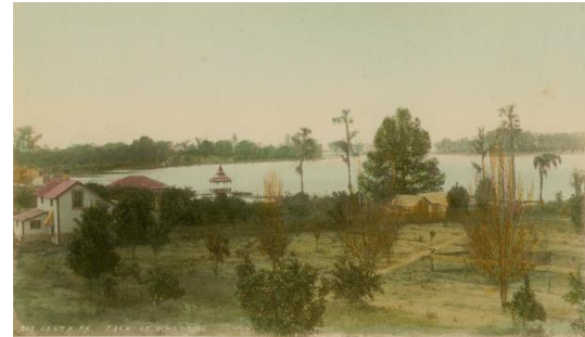
Melrose Bay circa 1890